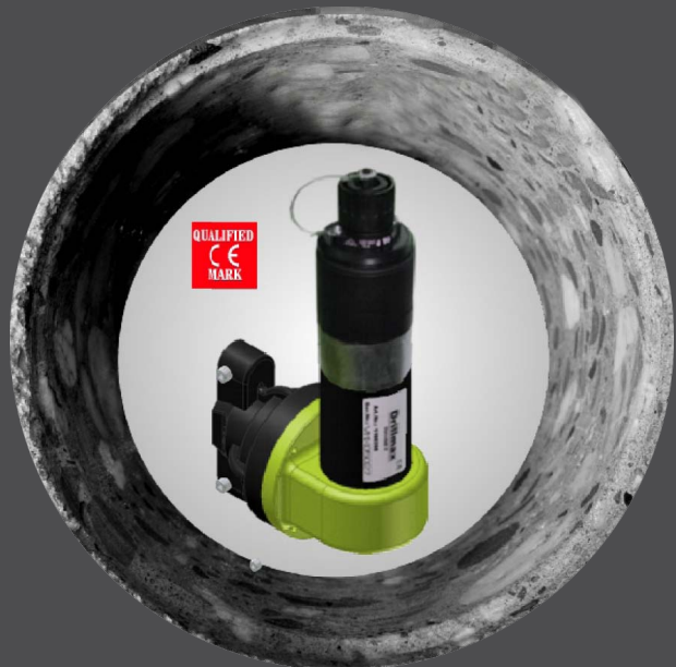
DRILLMAX AUTOFEED MOTOR AND DRIVE UNIT for fitting to most DS drill stands