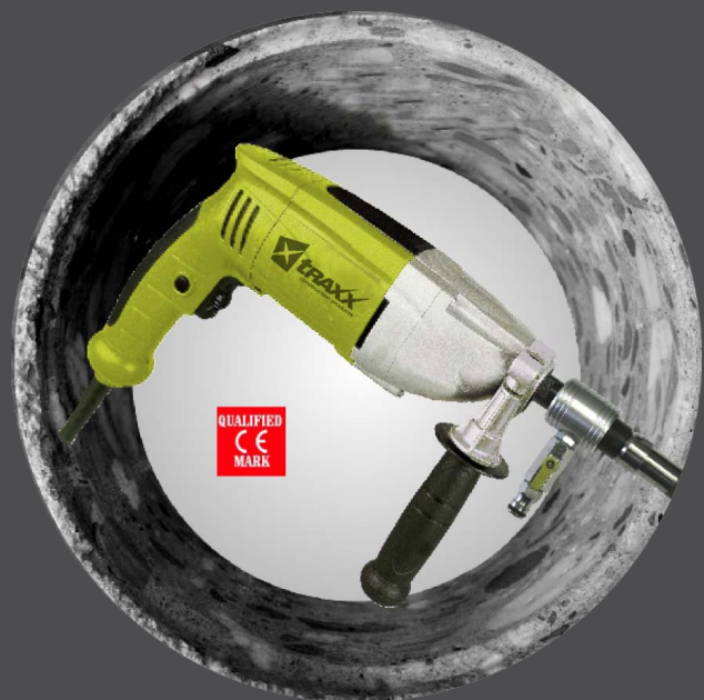
CORE DRILLING MACHINE DBM-50-S 800 watts of power for drilling in Granite and Marble tiles etc for fitting of taps and appliances. Water swivel included.