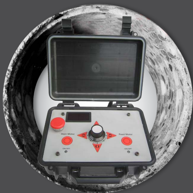
DRILLMAX CONTROL BOX - IT'S SO EASY !!! Heavy duty, waterproof control panel for DRILLMAX autofeed system. Makes effective drilling easy. 240 v / 180 w Art.-No.1160211